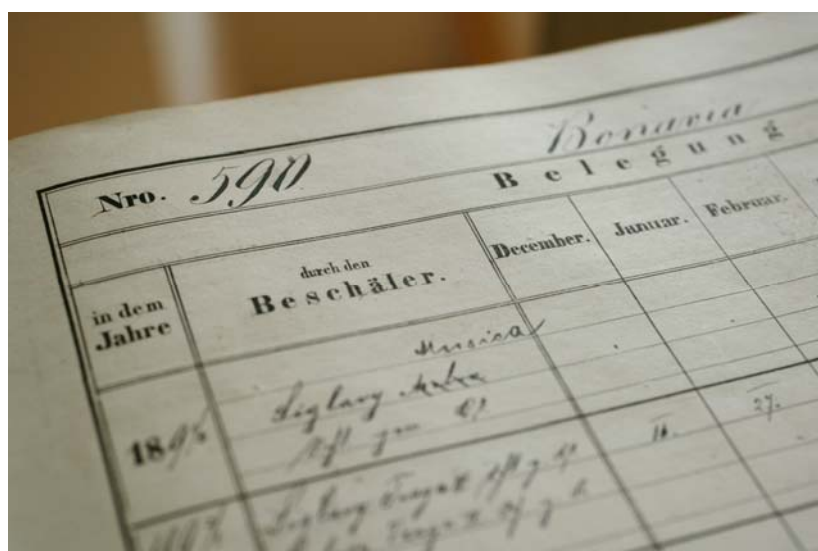
Lipizzaner stud books