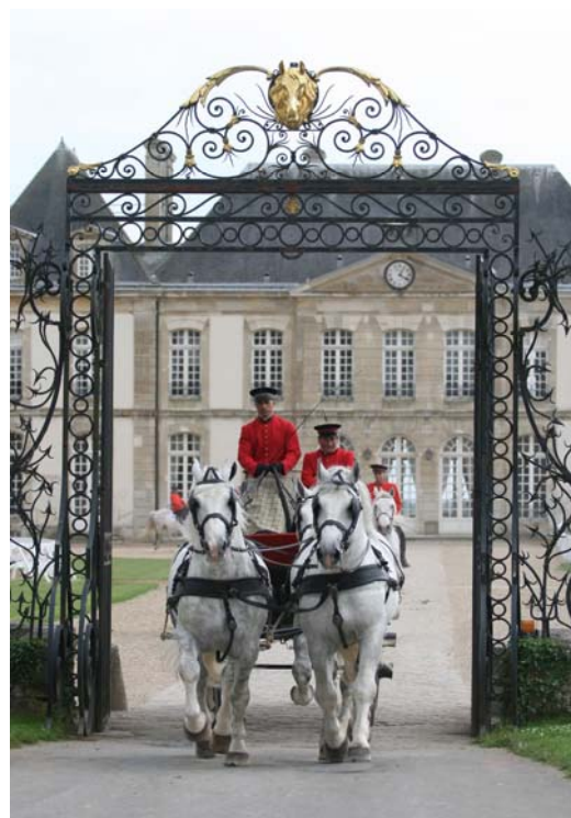
National Stud Le Pin