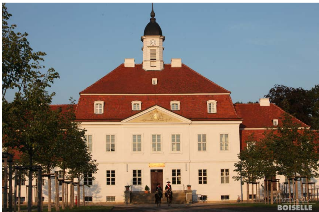
State Stud Neustadt-Dosse