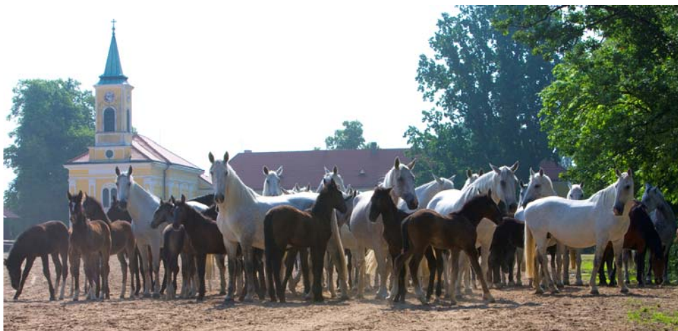
National Stud Kladruby nad Labem